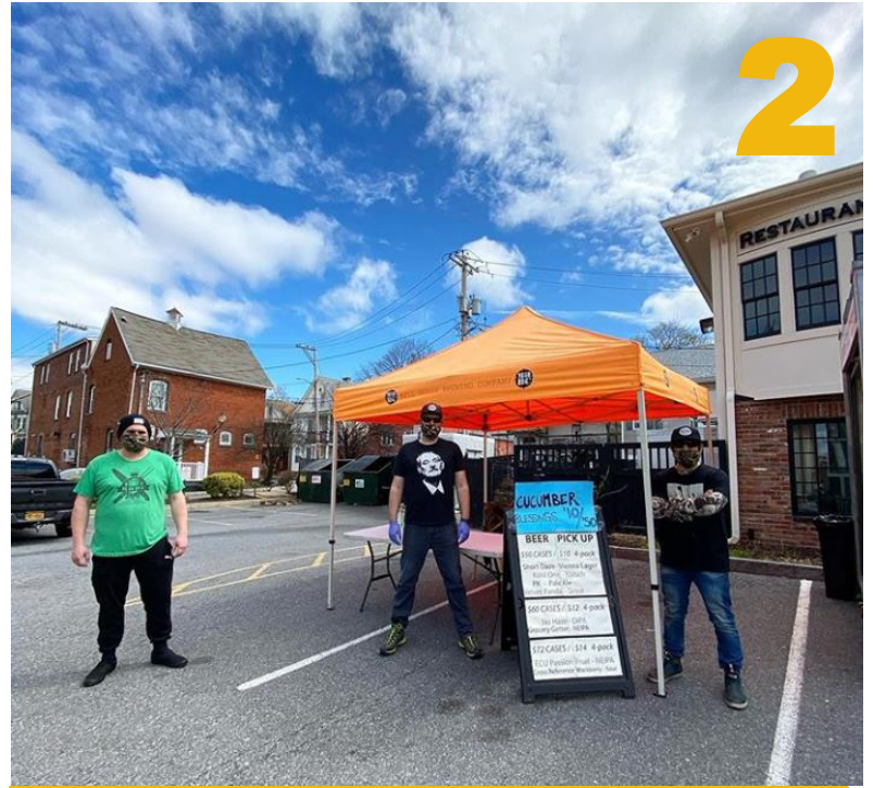
Private Off-Street Parking