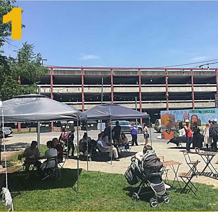
Private Open Space